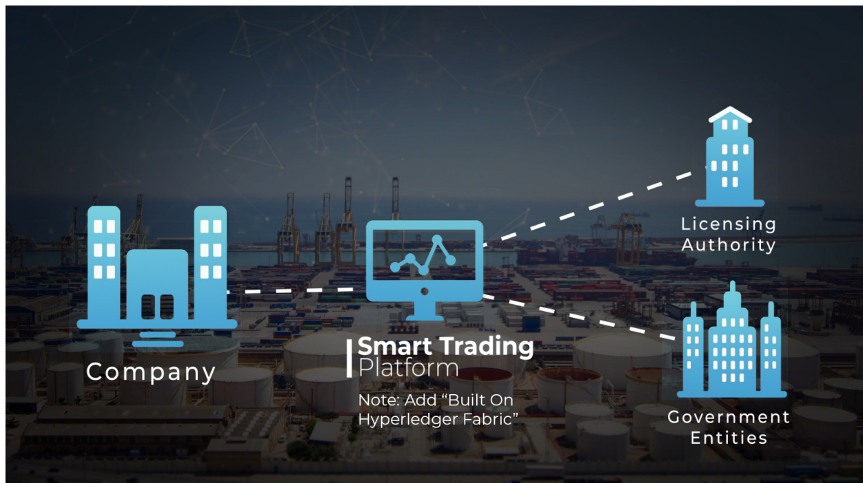
Unification of Trade Registration

For a road to be well-traveled, it must be smooth and easy to follow. But in Dubai, registering to import or export even a single container of goods was neither smooth nor easy. In reality, it was a lengthy process that touched on many authorities.